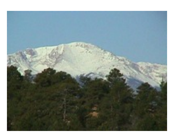
Pikes Peak Chapter The Compassionate Friends